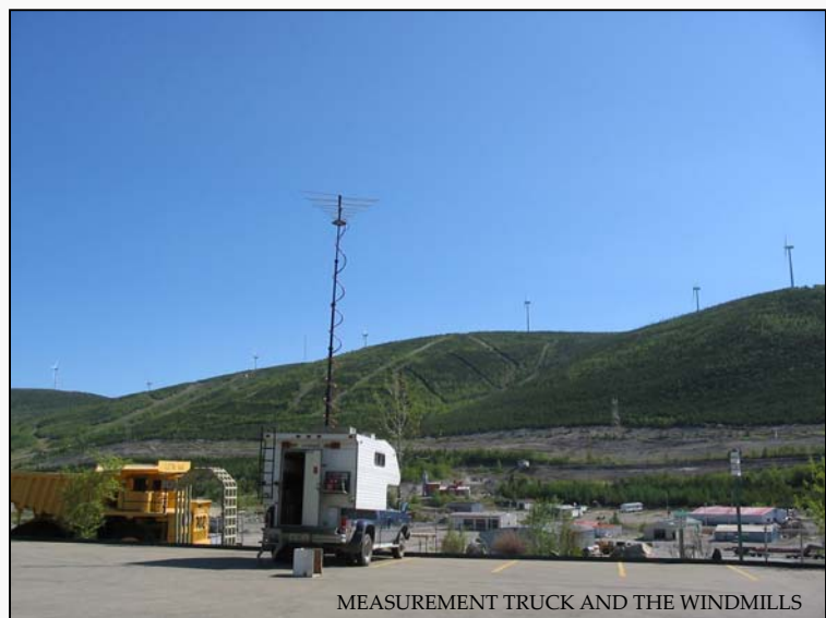
MEASUREMENT TRUCK AND THE WINDMILLS

In parallel with these measurements, Strategy and Planning has been working through the Broadcasting Technical Advisory Committee (B-TAC) to develop a technical paper defining the potential radio communication signal degradation in and around a wind turbine farm. The B-TAC Wind Turbine subcommittee (subcommittee 18), comprised of private broadcast consultants, Industry Canada and the CBC, recently completed its work and presented the paper to the main B-TAC committee in early October. This document will soon be available on the Industry Canada Web site and is intended to act as an aid to wind farm promoters, allowing them to quickly and easily assess if their proposed wind farms have the potential of degrading the quality of local over-the-air-signals. It also provides them with a number of possible mitigation measures that may help reduce or eliminate any detrimental effects their wind farm could have on local over-the-air transmission and reception.