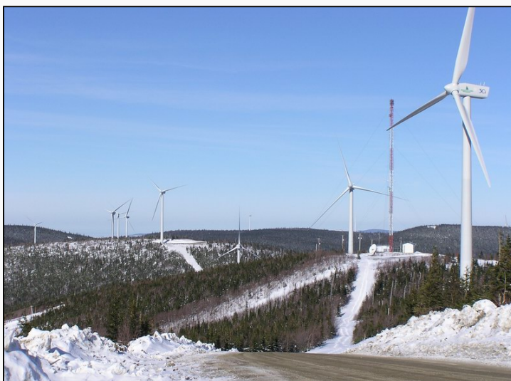
WINDMILLS AND OUR TELEVISION TRANSMITTER SITE NEAR MURDOCHVILLE

Four years ago, the Quebec Ministry of Environment notified the CBC that they were about to approve the development of a wind farm consisting of approximately 70 wind turbines, on the mountains around Murdochville, a small town two hours east of Matane on the Gaspé Bay peninsula. For several years, the CBC has operated two television stations in Murdochville: CBGAT-2, part of our French TV network; and CBMMT, part of our English TV network. Both stations are located on Mount Miller, on the outskirts of Murdochville.